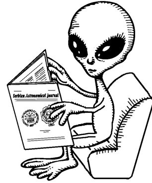
Fig. 1: This is an example of a small figure.

Tables 1 and 2 are examples of tables. For large tables it is necessary to switch from two column to single column environment. Table 1 gives number of students graduated from Department of Astronomy, Faculty of Mathematics, University of Belgrade in a given period. For more information check Belgrade astronomical community database – BAZA (from Serbian: Beogradska Astronomska ZAJednica) at http://alas.matf.bg.ac.rs/~astrobaza/ (see also Atanacković et al. 2009).